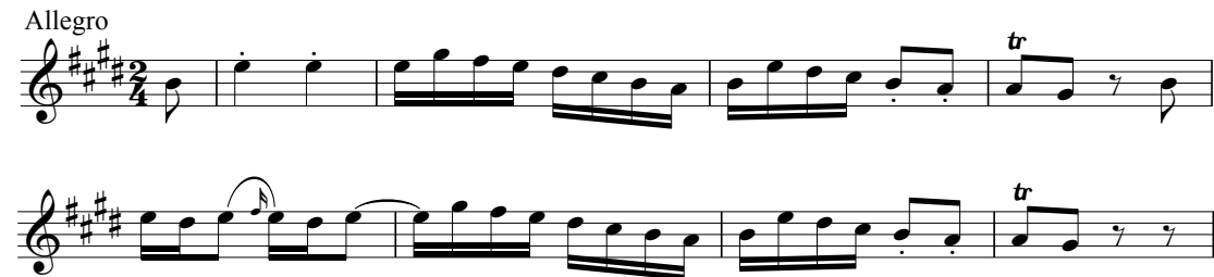
Ex.7 J.S Bach Sonata in E major BWV 1035, Allegro , bars 1-8

major Sonata BWV1035 (ex.7) and by Mozart's time, ornamentation was just as common in an allegro (ex.8).