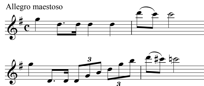
Ex.8 Mozart Concerto in G major, K313, Allegro maestoso , bars 149-150 and 153-154

So perhaps the many dance movements with binary repeats in the fantasias are ripe for decoration. Both Quantz and Telemann left examples which were heavily ornamented from start to finish, yet Quantz added that “You must never do so in excess, lest the principal notes be obscured, and the plain air be unrecognizable. You must play the principal subject at the very beginning just as it is written. If it returns frequently, a few notes may be added the first time, and still more the second, forming either running passage-work, or passage-work broken through the harmony. The third time you must again desist and add almost nothing, in order to maintain the constant attention of the listeners”. 1 Such ornamentation was meant to be improvised, or at least sound as if it were freshly dreamt up.